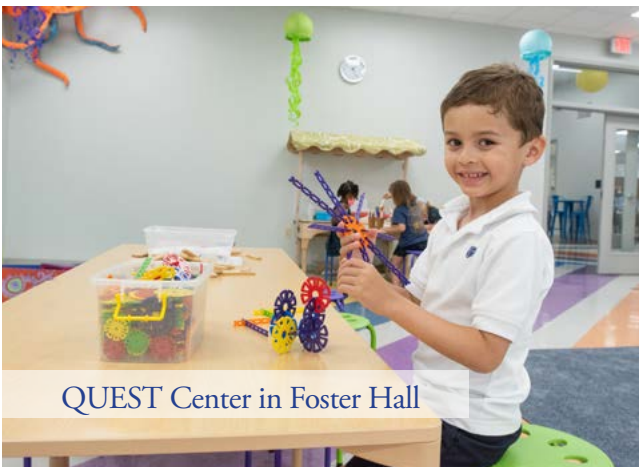
QUEST Center in Foster Hall