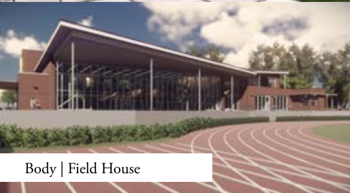
Body | Field House