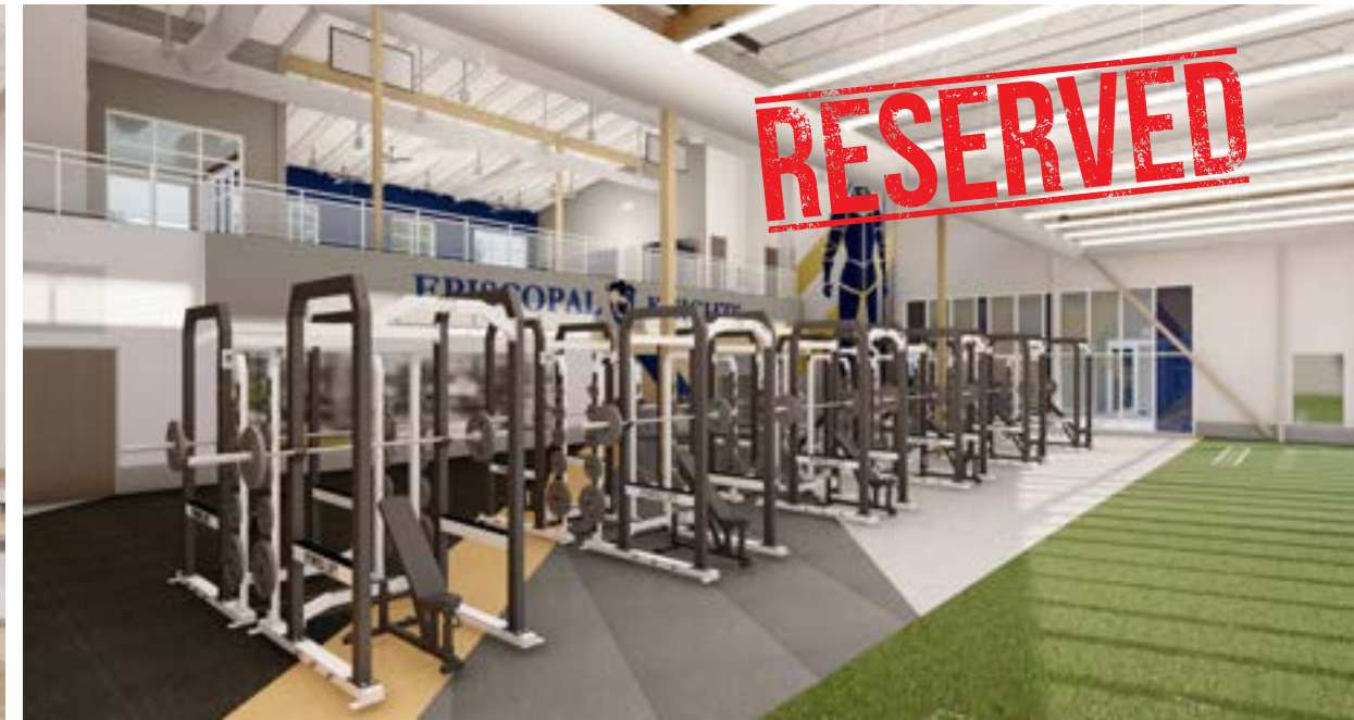
Main Strength Training and Conditioning Room