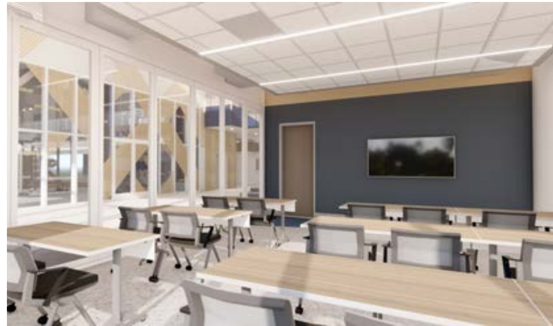
Classroom and Team Meeting Space