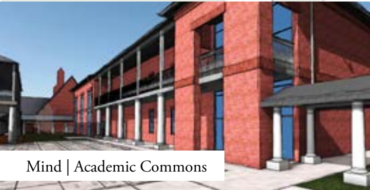
Mind | Academic Commons