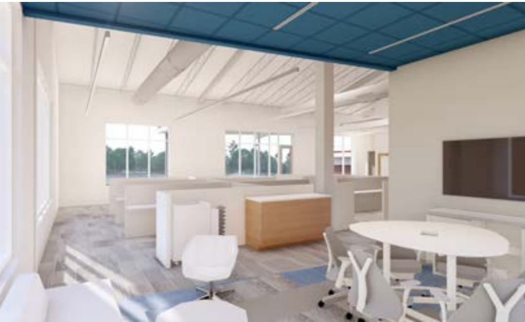
Coaches' Collaboration Area